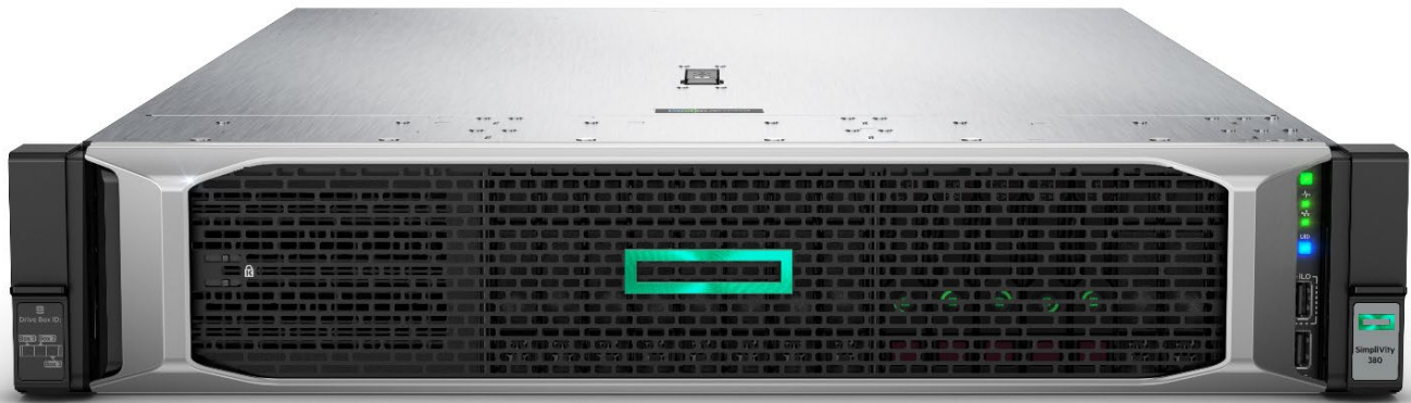
HPE SimpliVity 380 Gen10/Gen10 Plus

HPE SimpliVity 380, based on the HPE ProLiant DL380 Gen10 and Gen10 Plus Servers, is a compact, scalable, 2U rack-mounted building block that delivers integrated server, storage, and storage networking services. Adaptable for diverse virtualized workloads, the secure 2U HPE SimpliVity 380 Gen10 and Gen10 Plus delivers world-class performance with the right balance of expandability and scalability. It also provides a complete set of advanced functionalities that enable dramatic improvements to the efficiency, management, protection, and performance at a fraction of the cost and complexity of today's traditional infrastructure stack.